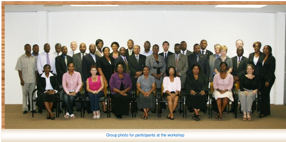
Group photo for participants at the workshop