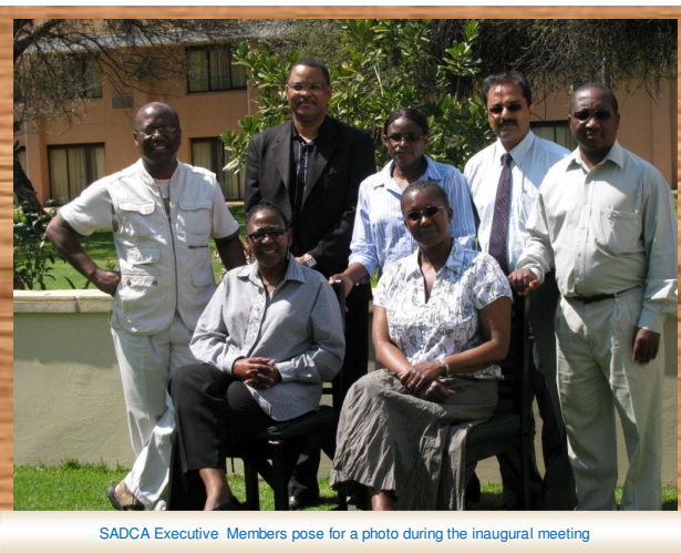
SADCA Executive Members pose for a photo during the inaugural meeting