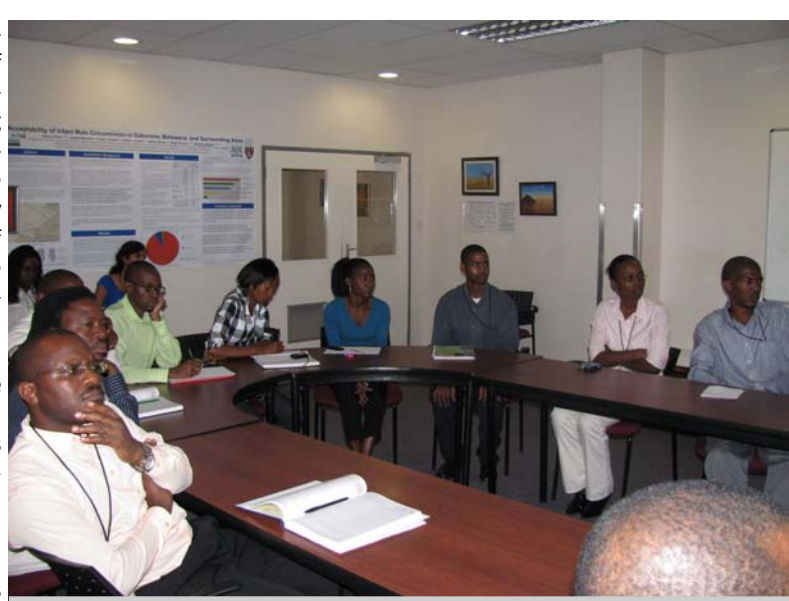
Botswana Harvard AIDS Institute partnership staff members during the meeting with $\sf SADCAS$

The SADCAS CEO then gave a very informative and eloquent presentation on SADCAS and importance of accreditation in relation to BHP's mandate. This was then followed by lively interactions as the laboratory personnel wanted to know about the benefits of accreditation and the distinction between services provided by SADCAS as opposed to other organizations such as the Botswana Bureau of Standards (BOBS) and the World Health Organization (WHO) AFRO Laboratory Accreditation Pro-