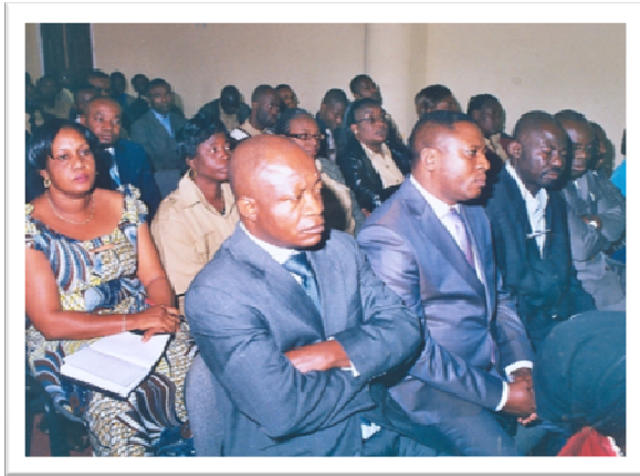
Participants attend the World Accreditation Day celebrations in Democratic Republic of Congo (DRC)

In Seychelles in addition to the press release, an article on accreditation was published in the local newspaper and an awareness training workshop was conducted on 15 June 2010 at the Seychelles Bureau Of Standards in Mahe.