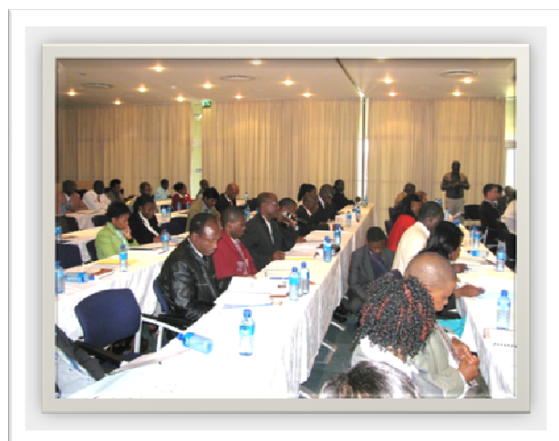
Participants attending the World Accreditation Day Celebrations in Gaborone, Botswana

In Mozambique interviews were held with 2 of the most popular television channels during which the NAFP talked about the importance of accreditation and the process of accreditation. Some of the Mozambique radio stations announced the commemoration of world accreditation day.