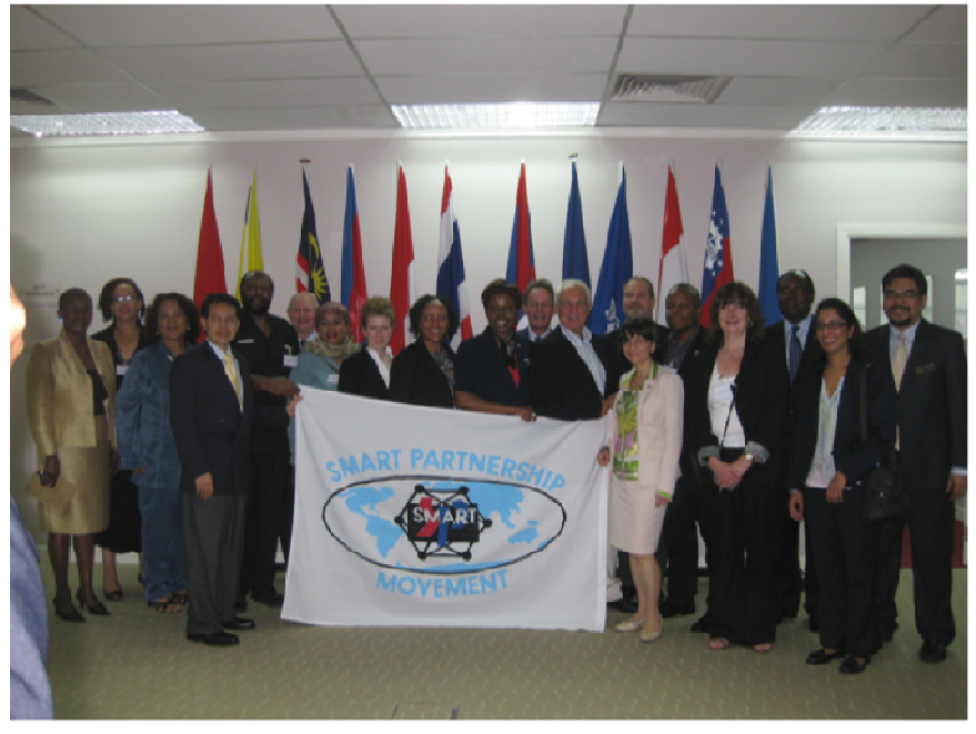
Delegates to the Smart Partnership Dialogue held in Kuala Lumpur, Malaysia 14 to 15 June 2010.

The dialogue was jointly hosted by the Smart Partnership Movement, Standards Malaysia and MIGHT. The dialogue was attended by over 50 participants from trade, business, national standards bodies, regional bodies and governments from Southern and East African Countries including High Commissions from Uganda, Lesotho, Namibia, Swaziland and Zambia. Representing the trade sector were members of the Malaysian Ministry of International Trade and Industry, Federation of Malaysian Manufacturers and Malaysian External Trade Development Cooperation amongst others. The private sector was represented by SIRIM Berhad a Malaysian conformity assessment body amongst other private Malaysian companies, LCM Systems an Australian company, Schoemans Office Systems a Namibian company and Theta