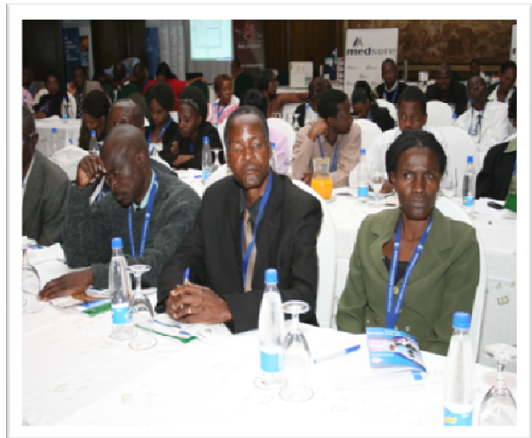
Delegates attending the 2010 ZINQAP Annual Scientific Conference