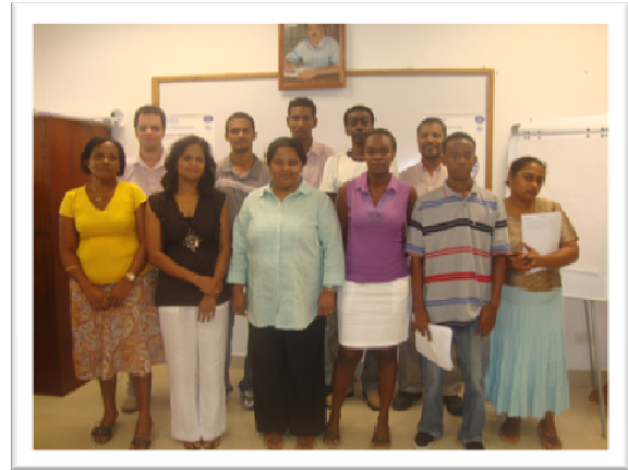
Participants at an awareness training workshop during World Accreditation Day in Seychelles