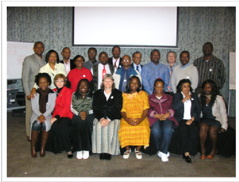
Participants pose for a photo during the training

The accreditation component of the SADC/EU SQAM project is mainly focused on the development of a pool of accreditation experts in the SADC region who will, upon successful completion and registration, undertake assessments/conduct training on behalf of SADCAS. In 2009 the capacity development program started off with the training of technical experts on the various key accreditation standards i.e. ISO/IEC 17025, ISO/IEC 17020, ISO/IEC 17021, ISO/IEC Guide 65 and ISO 15189. This was then followed by technical assessor courses. Those who successfully completed the technical assessor course proceeded on to do the lead assessor course. During these courses a number of experts, 19 in all, were identified as potential trainers for SADCAS thus selected to attend the train the trainer course.