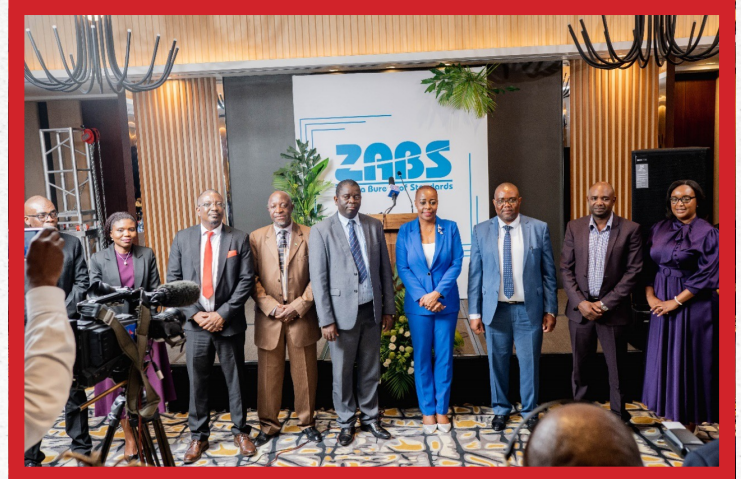
Permanent Secretary, ZABS Senior Management, together with SADCAS Chief Executive Officer pose for photos at the end of the event.